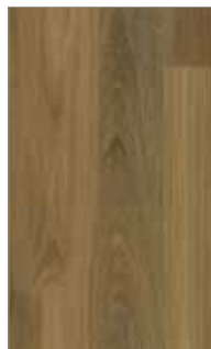
555 COLONIAL SPOTTED GUM