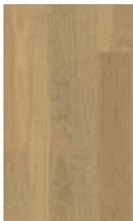
545 COLONIAL BLACKBUTT