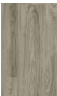
730 NOTTING HILL