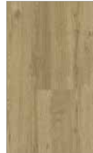
520 PARK LANE