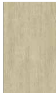
560 HIGH STREET