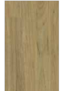
530 ST JAMES