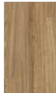
625 MARBLE ARCH