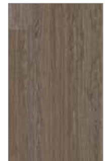
640 FLEET STREET