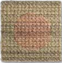
Competitor Solution Dyed / Yarn Dyed Blend